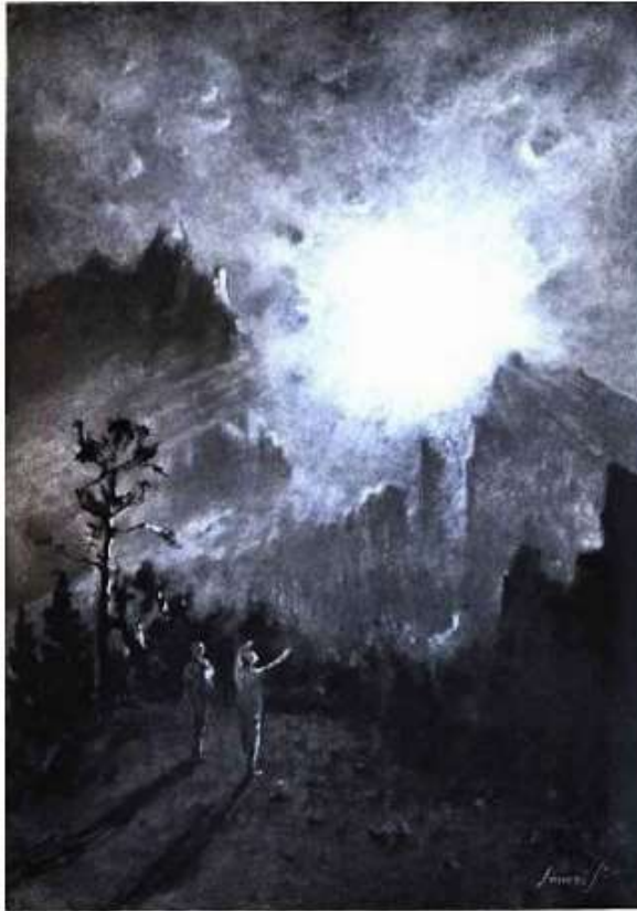
The sun blazing among the peaks... will spin at our command.

"I know not by what devices, by what miracle of patience, the method will be won, but I know that they will go out into the deeps. I can see those first pioneers, the little craft dwindle up into the sky, glittering, twinkling, a speck swallowed up at last by the quivering blue. They may be lost, but other men will follow them in this eternal adventure of mankind."