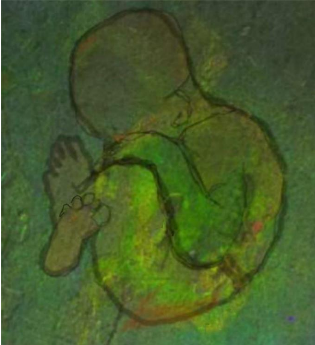
5. Boy on a horse