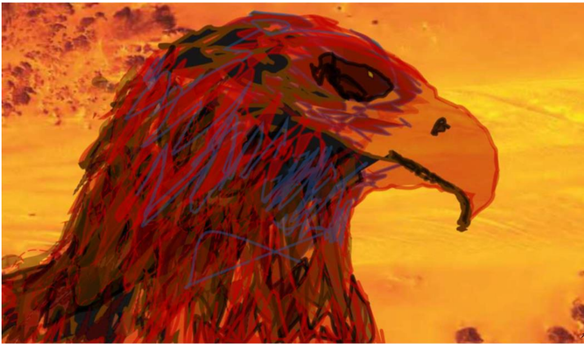
3. Karak (Black Cockatoo)